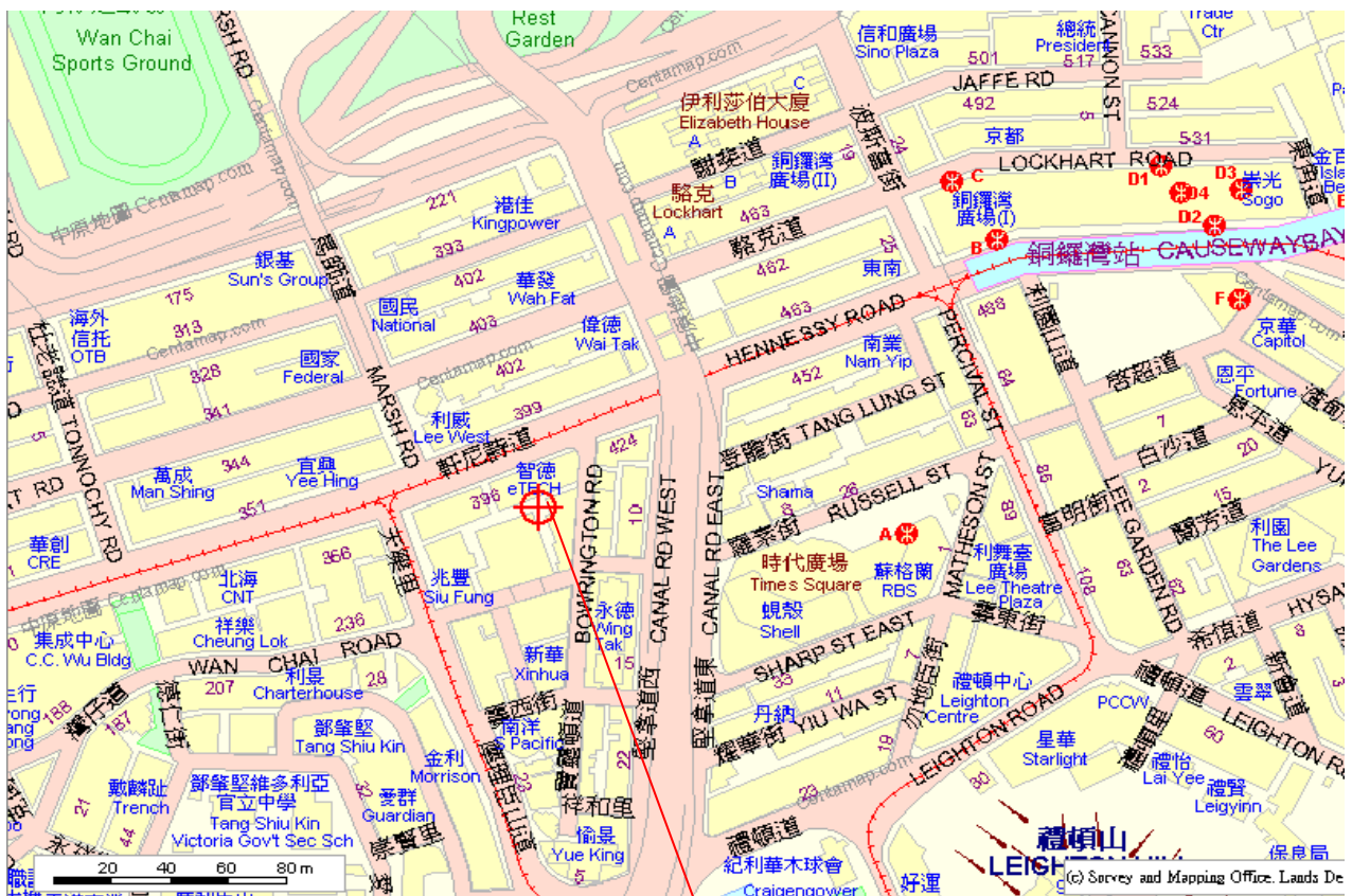
E-Tech Centre (智德中心)